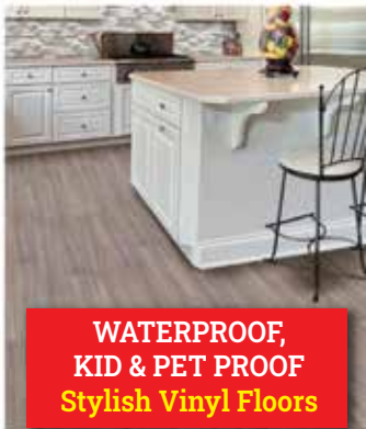
WATERPROOF, KID & PET PROOF Stylish Vinyl Floors

Check Our Website For More Deals: www.Millenniumclasscarpet.com