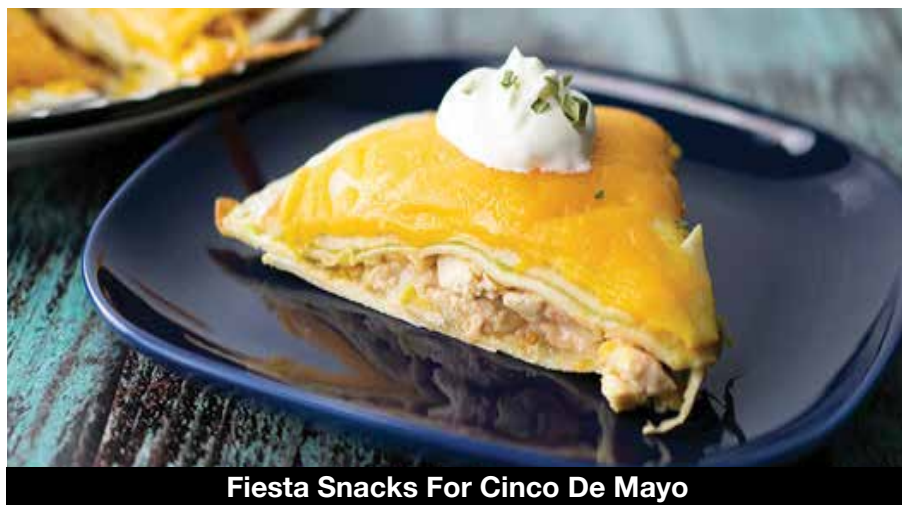
Fiesta Snacks For Cinco De Mayo