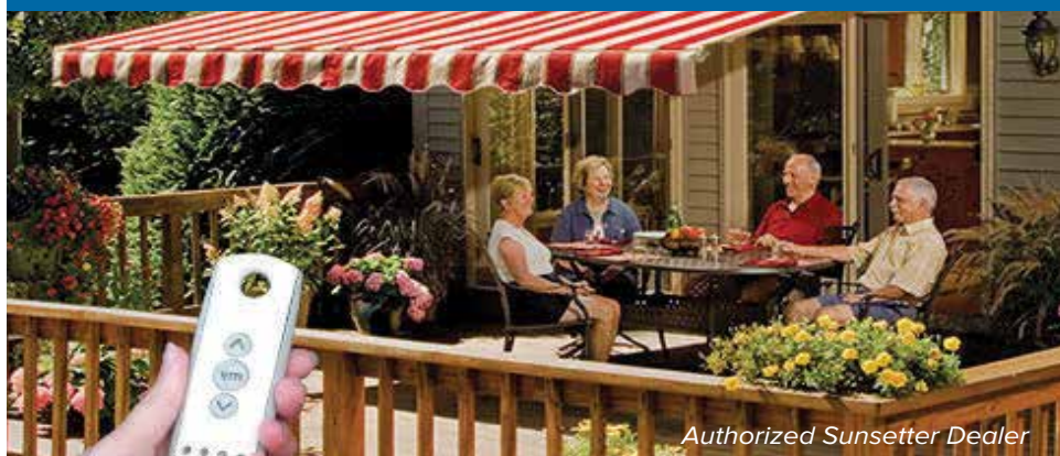
Authorized Sunsetter Dealer