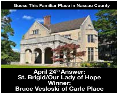
Guess This Familiar Place in Nassau County