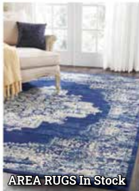
AREA RUGS In Stock

With coupon only. Expires 5/31/24. Not to be combined with advertised specials. Must present at time of purchase. Coupon must be redeemed prior to order.