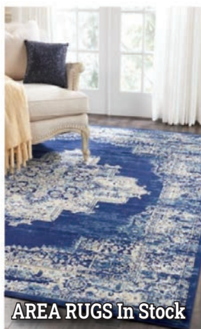
AREA RUGS In Stock

With coupon only. Expires 2/18/24. Not to be combined with advertised specials. Must present at time of purchase. Coupon must be redeemed prior to order.