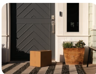
Know When People and Packages Arrive