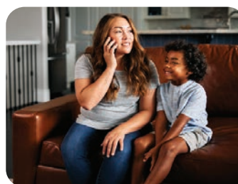
Peace of Mind Starts Here