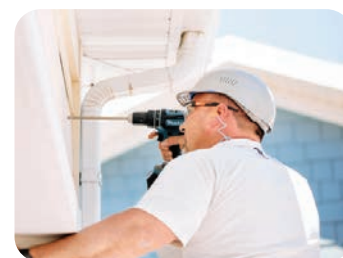
Get FREE Professional Installation and Four FREE Months of Monitoring Service*

One Connected System For Total Peace of Mind