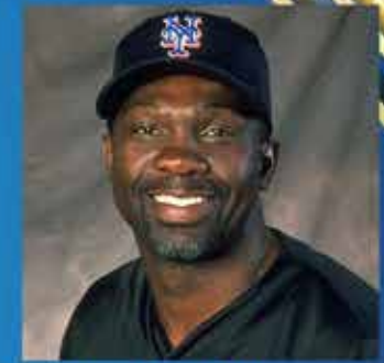
Mookie Wilson NY Mets 1986 World Series Champion and Co-Founder of Legacy Catering