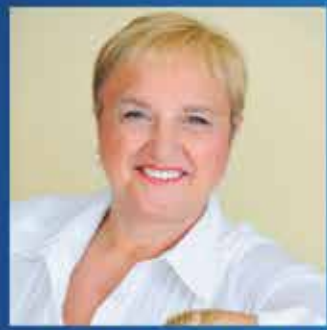
Lidia Bastianich Emmy Award-Winning Television Host, Best-Selling Cookbook Author, & Restaurateur

Benefitting the children and adults with disabilities The Viscardi Center serves