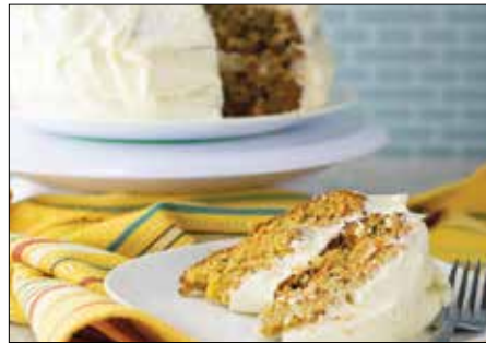
Find more dessert inspiration at Culinary.net .

In mixing bowl, cream together oil and sugar. Add eggs one at a time. Gradually add in carrots and crushed pineapple.