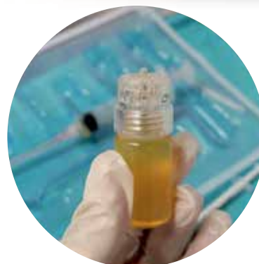
PRP & STEM CELLS