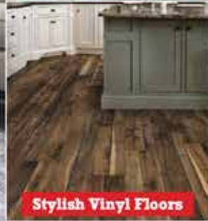
Stylish Vinyl Floors